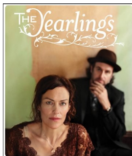
Yearlings Trad Stage Fri 9pm