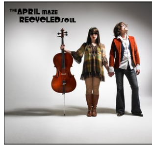
April Maze Main Stage Fri 9pm