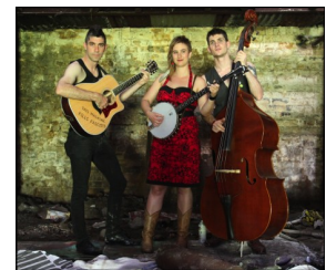
The Lurkers Trad Stage Fri 9.15pm

Farmers Market Sat Morning Coronation Park 8-12pm Mayne St Stalls all day Saturday/Sunday