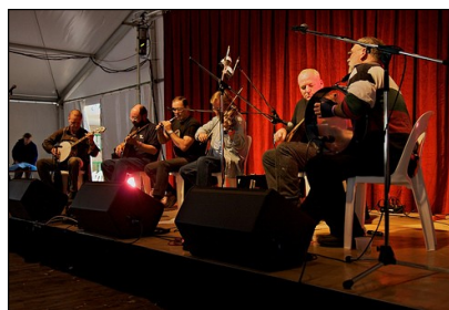
Senor Cabrales Trad Stage Sat night 8pm